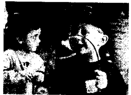
"Looky, Mom! I got an Easter basket!!"