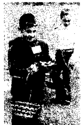
"I know those eggs are around here somewhere."

We desperately need the following: towels, washcloths, deodorant, razors, shave cream, and winter work gloves.